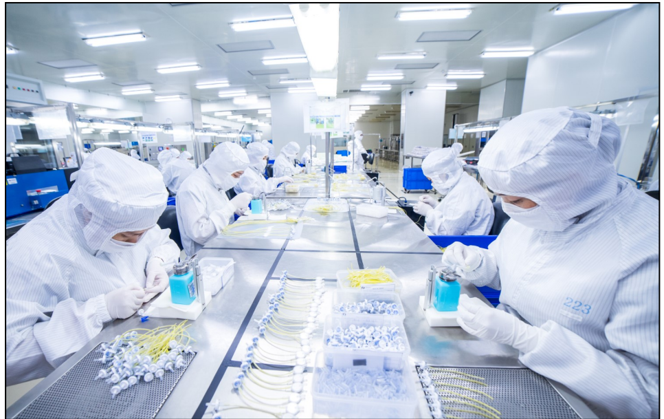
ISO 45001: 2018 provides a framework for occupational health & safety, enabling organizations to build a model for a safe and healthy workplace that can be deployed worldwide.

The overall benefit of the framework is its ability to create an organizational vision for a comprehensive environmental management system with a standardized approach to assessing environmental impact, driving continuous improvement, ensuring compliance with legal requirements, and increasing stakeholder and customer trust. It also makes it easier to